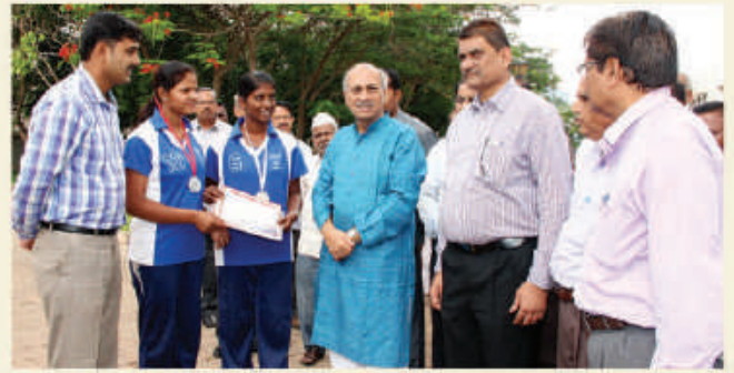
Felicitation of Second Prize winners at National level Tchoukball