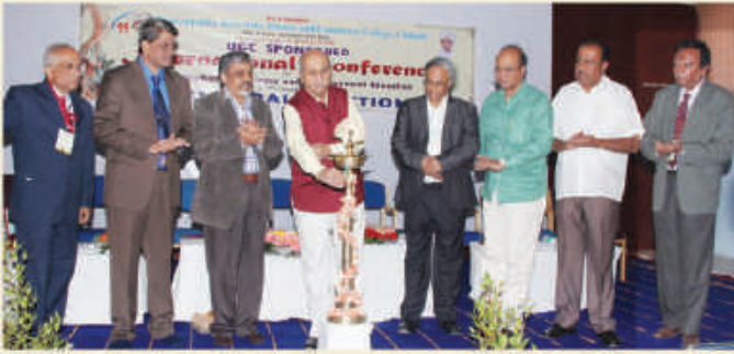
Inauguration of the International Conference