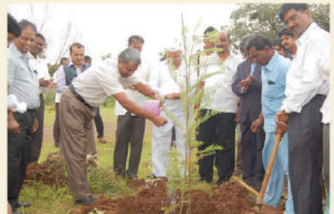
Celebration of Chairman's Birth Day on 1 st August