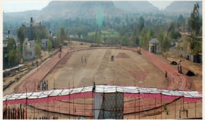
400 Mtr Trak