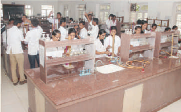
Dept. of Chemistry