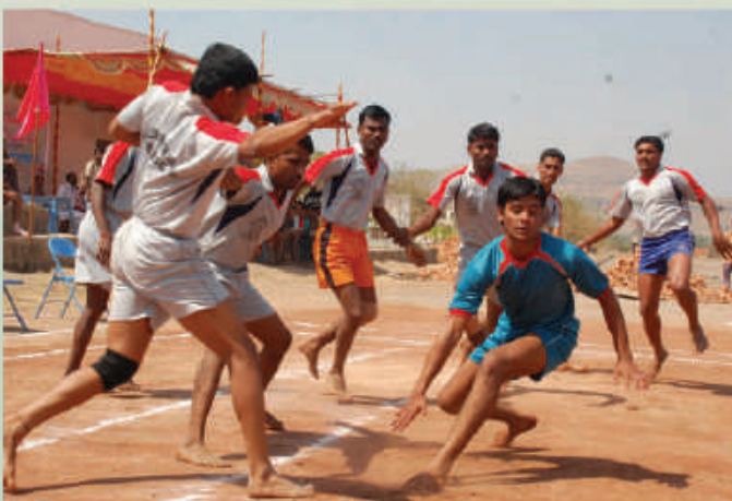
Annual Sports Meet