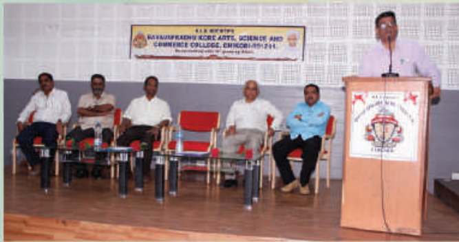
Students Orientation Programme