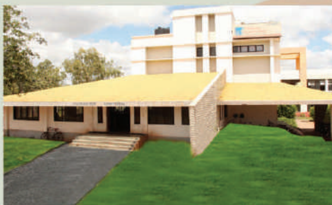
College Canteen & Canara Bank