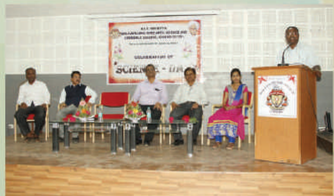
Celebration of Science Day