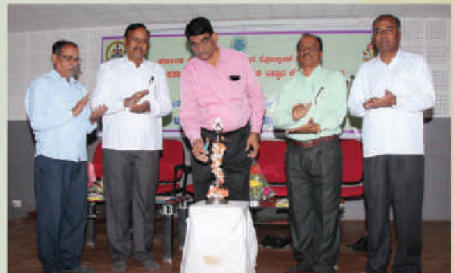
District Level Science Drama Competition