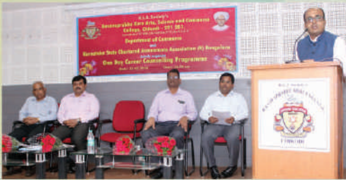
One Day Career Counselling Programme