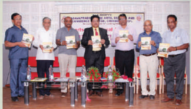
Inauguration of Sports and Cultural Activities